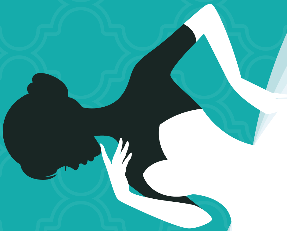
EXHIBIT AT THE 49 TH ANNUAL