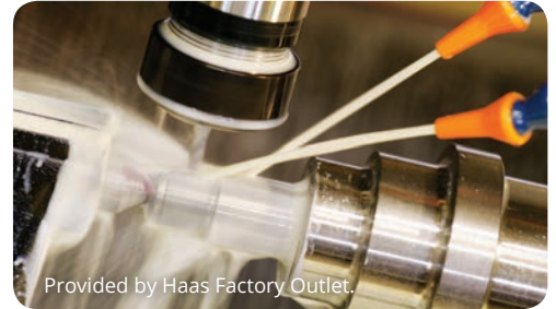
Provided by Haas Factory Outlet.